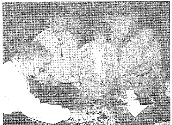
Another 60 th Anniversary Photo