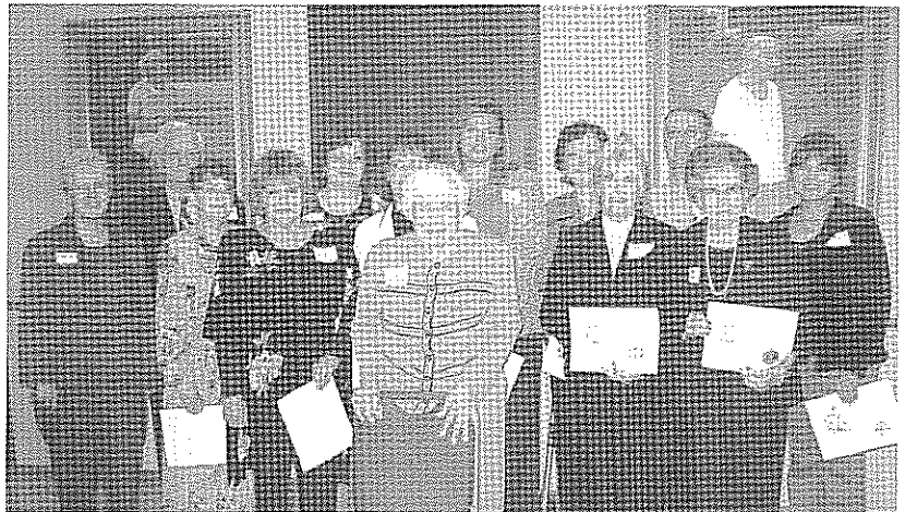
Above: Photo of Mayflower members who received their passports at the 60 th Anniversary Compact Meeting, November 10, 2007.