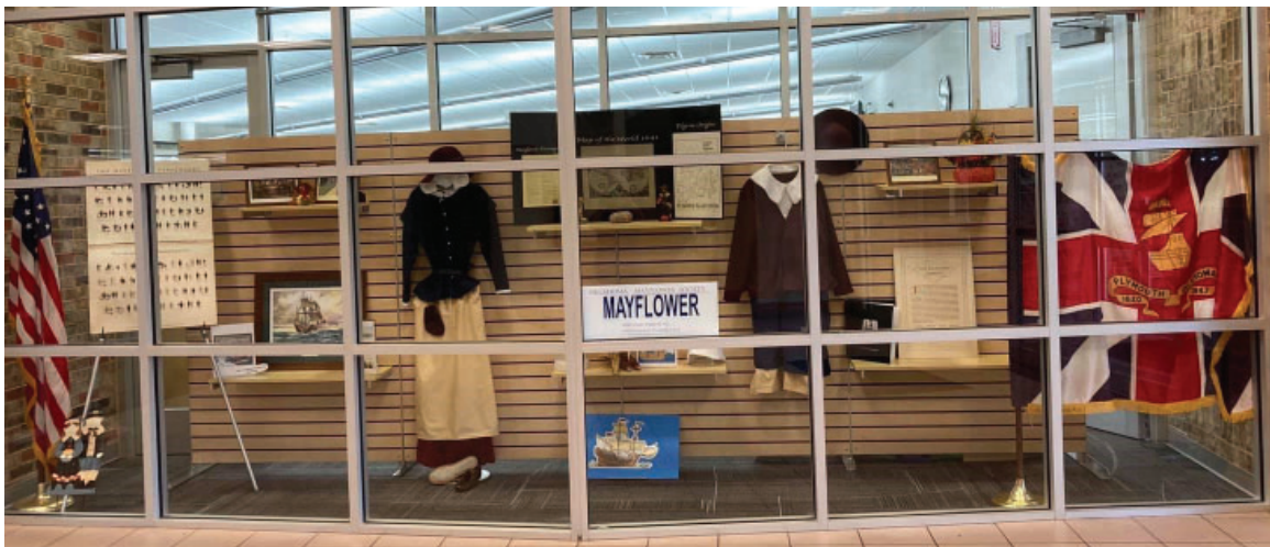
Materials available for display